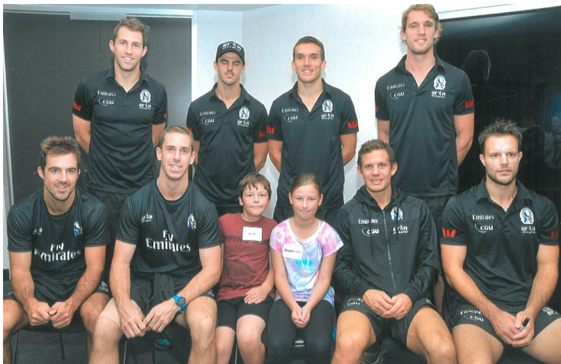
COLLINGWOOD FOOTBALL CLUB CLINIC

There is a late arrival, early departures (students) and visitor's (parents) book that needs to be signed at the office counter on a regular basis if the need arises. This will aid our emergency management of the school.