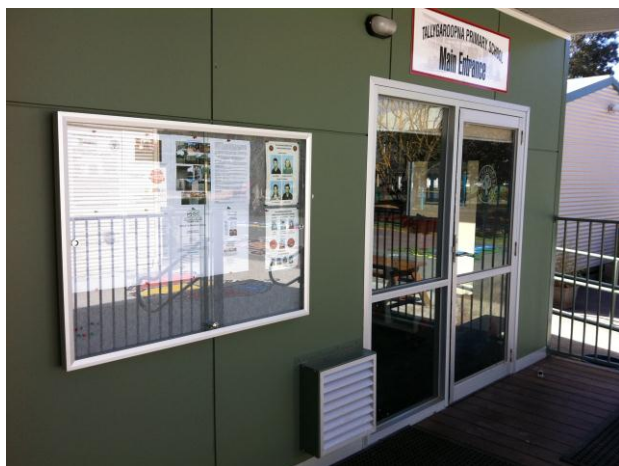
New Front Entrance