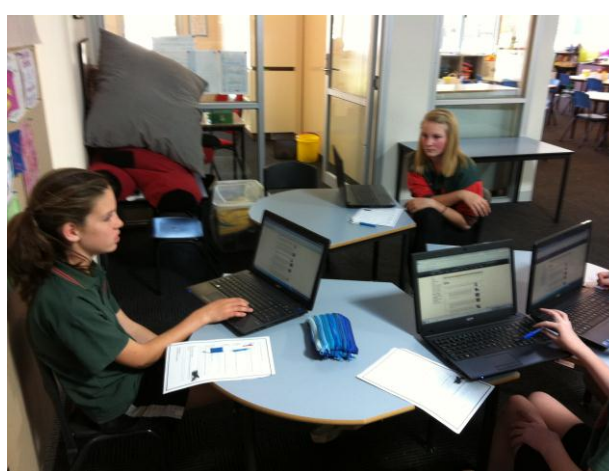
Classroom Activities – The Ultranet