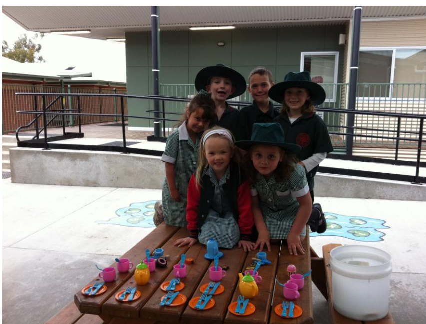
Tea Anyone !!!!!!!