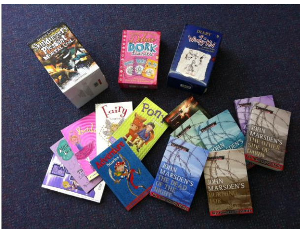
New School Books