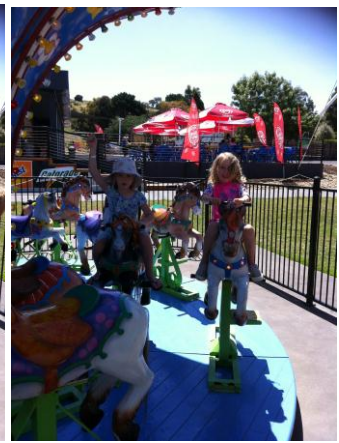
Bush to Beach Program