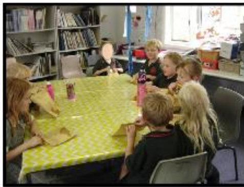
Using our senses to discover what was in the mystery bag experiment.

We also tricked our senses using an apple slice and vanilla essence. (See the instructions below if you would like to try this at home!) Then we looked at animals that have super senses and how they use those over developed senses to survive. For example, a shark's sense of smell.