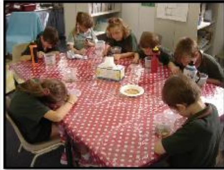
Above: Taking a closer look at our mealworm pets with magnifying glasses.