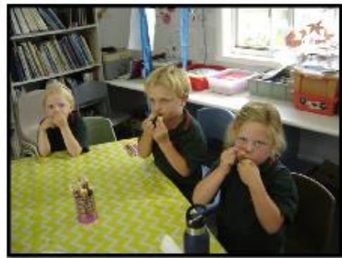
Tricking our senses with the vanilla and apple