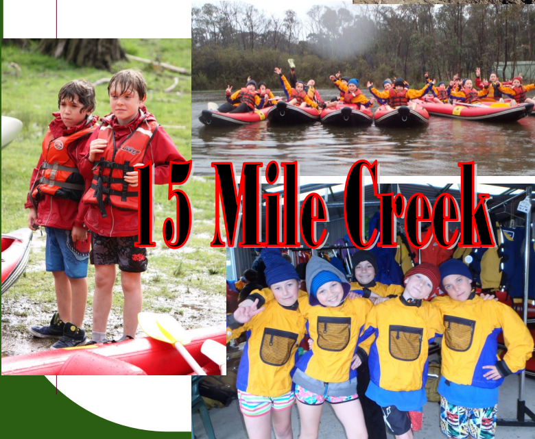
15 Mile Creek