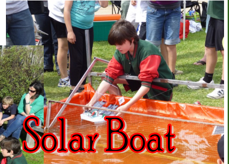
Solar Boat Challenge