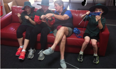
Lunchtime Knitting Group