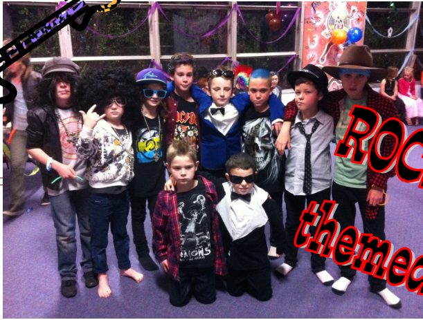
Rock Star themed Disco